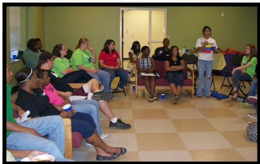
Left: McNair Scholars host the Upward Bound Bridge Students in a mentoring mixer