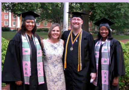
Congratulations McNair Scholars!!! Best wishes for a fabulous future!