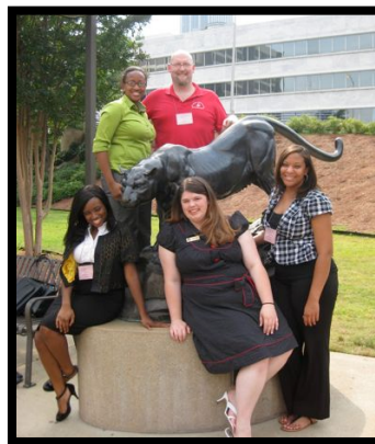
McNair Research Conference Georgia State University