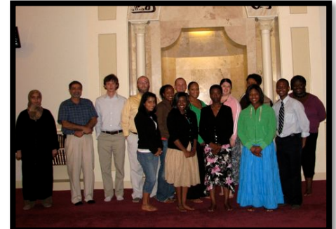
Hoover Crescent Islamic Center