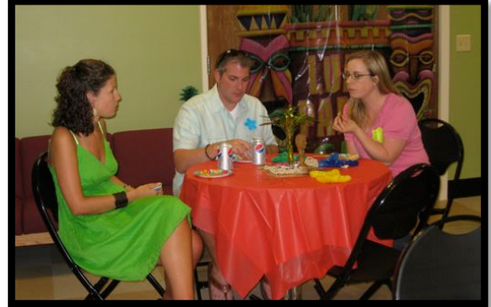
Right: Faculty Mentor Mixer – Luau Style!