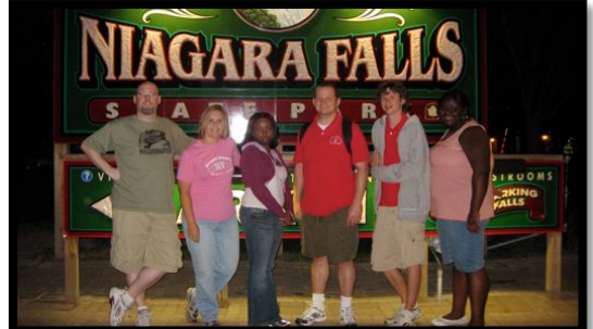
Right: Taking a break from the University at Buffalo Conference to enjoy Niagara Falls