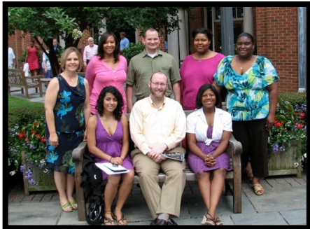
Alabama Shakespeare Festival Comedy of Errors

Vanderbilt University, Belmont University, Tennessee State University, and Middle Tennessee State University. As Scholars prepare to graduate, they participate in an exit interview with the Program Director. Overwhelmingly, one of the top-rated activities indicated by Scholars at that time is exposure to graduate programs.