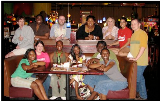
Left: McNair Scholars at Dave & Buster's in Nashville, TN