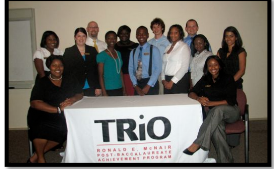
Right: McNair Scholars breathe a sigh of relief after the summer research presentations!